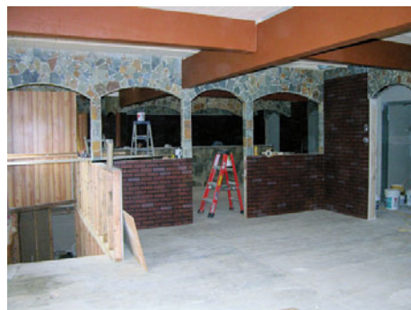
Under-construction view of bar (background) and future seating area in foreground (second floor)

The restaurant is moving from its former Stadium district location. This new location will be a surprisingly spacious and delightful 3000+ square feet on two floors carved out of former storage space in the market.