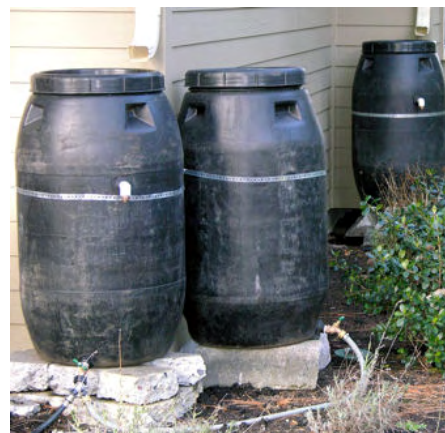
Part of 10-barrel installation at UPS' "Live Green" House on No. 13th

fish habitat, it saves energy as it does not have to be transported from a source.