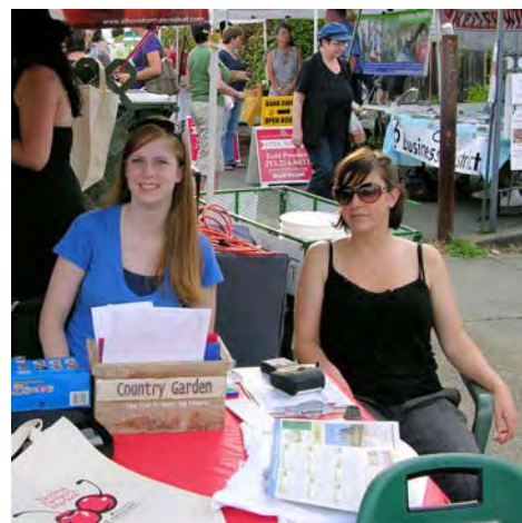
The Information Booth where Food Stamp Cards and debit & credit cards can be converted to tokens for purchases.

Door prizes were given by Bartells (mini electric grill); Del Brocco's Pizza (gift certificate), Studio 6 Ballroom, (dance lesson), Northwest Costume, (costume bag). Thanks to all.