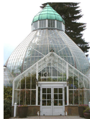
Seymour Conservatory in Wright Park

Greetings this Groundhog Day from Bonner Law Office. The groundhog did see his shadow today. Still, let us hope for more sunshine this month and, perhaps, some glimpses of spring. February possesses two causes for celebration: Valentine's Day and Presidents' Day weekend. Both these special days are excellent times to rejoice during this mid-winter season. With these days come more light and more sunshine, despite being cold. Sometimes, the presence of mid-February snow reminds us that February is an excellent skiing month, as well as being the month of the Super Bowl.